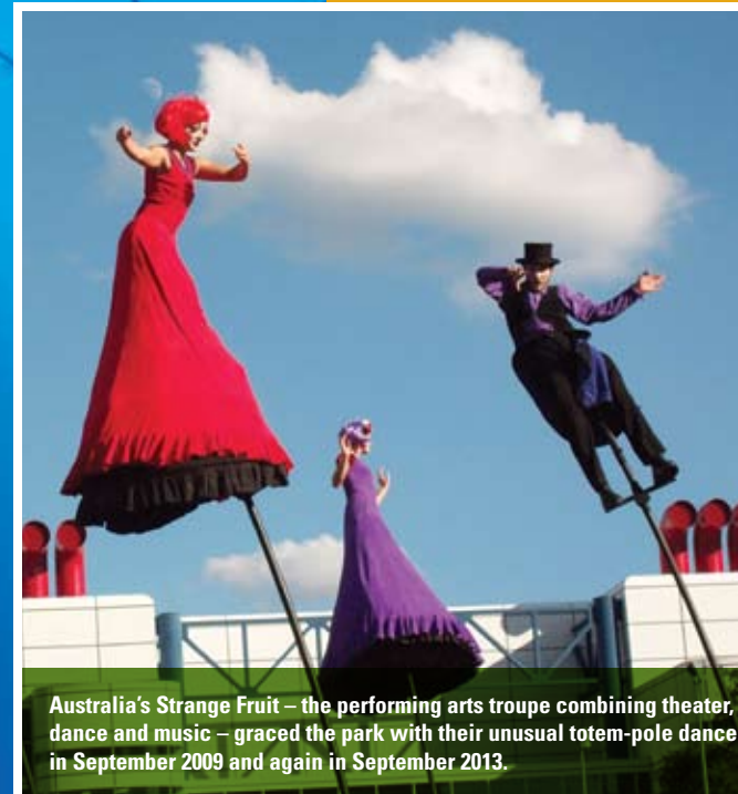
Australia's Strange Fruit – the performing arts troupe combining theater, dance and music – graced the park with their unusual totem-pole dance in September 2009 and again in September 2013.