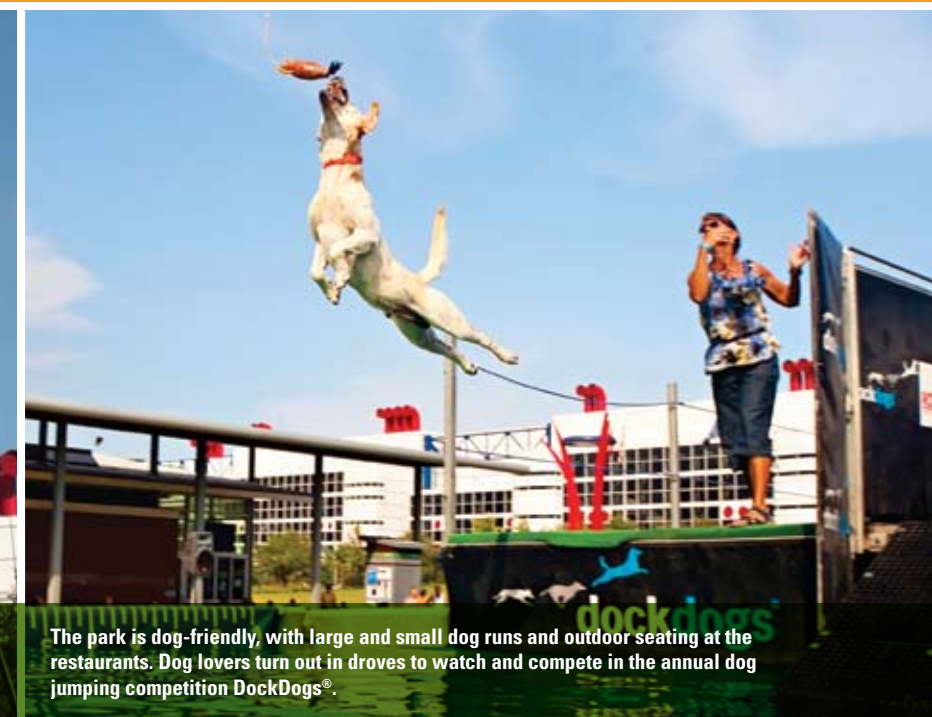
The park is dog-friendly, with large and small dog runs and outdoor seating at the restaurants. Dog lovers turn out in droves to watch and compete in the annual dog jumping competition DockDogs®.

All of the sidewalk pavers on the front and south sides of the Alkek Building, which houses the Discovery Green offices, are meaningful. Each one represents a park-lover's willingness to give something back to Discovery Green. The pavers usually boast a family name, or the name of an individual, engraved into the brick. But one paver is a bit of a head scratcher: the one bearing the unusual name GabJorAmaZan.